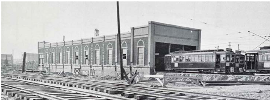
4b. 1921 view showing the south side of complex with arched window surrounds that remain visible on the interior following the additions to the site that year